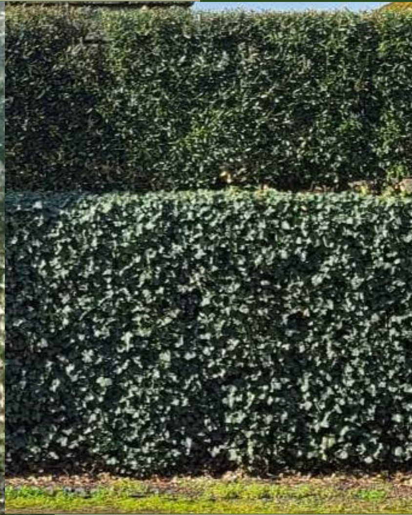
6 months post-installation