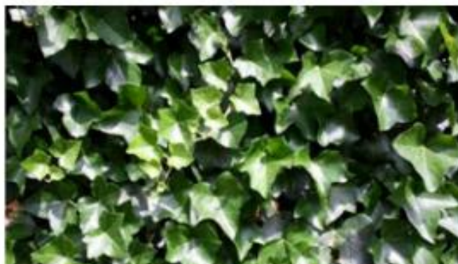
Ivy « Hedera Helix Ibernica »